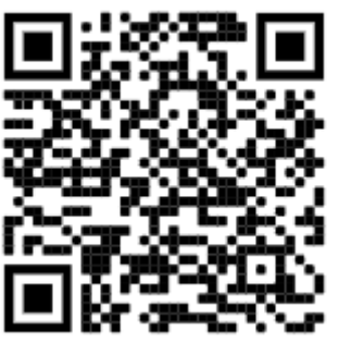
Link to address standard guide