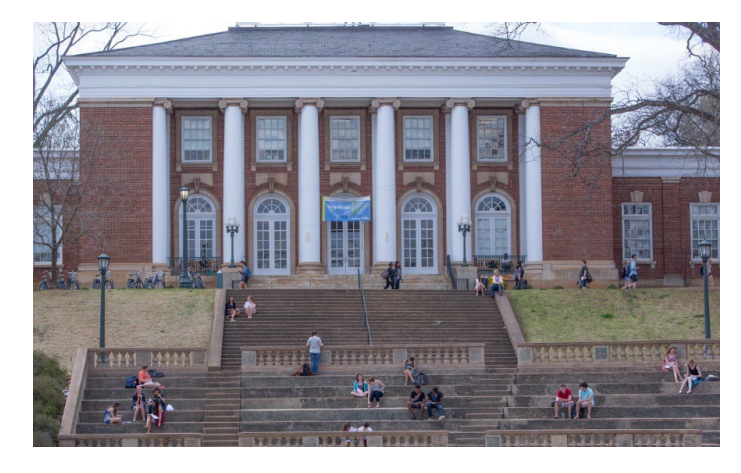
Located in Minor Hall (2<sup>nd</sup> floor)

SEEK ADVICE ONLY WITH THE ISO when you require information that may impact your immigration status in the U.S.